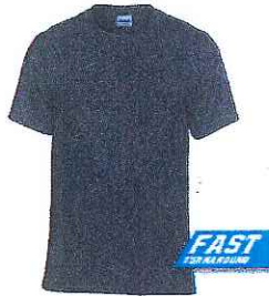
HEATHER CHARCOAL BASIC SHORT SLEEVE T-SHIRT